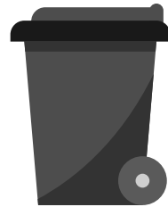
Table and garden waste (See list on page 4)