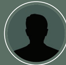
Vacant COUNCILLOR DISTRICT 6